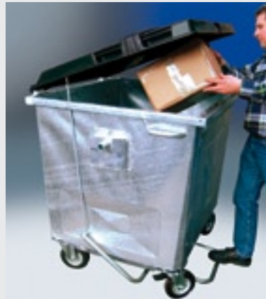
Illustrated foot pedal as optional extra complete with unique mechanism for controlled lid closing